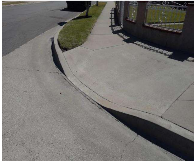
Curb Ramp , Landings and Transitions : Top Landing Clear Length - Landings

Code Reference ADA 406, 406.4,CA 11B-406.5.3