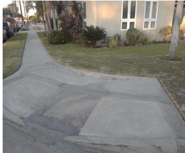
Curb Ramp , Landings and Transitions : Top Landing Slope

Code Reference ADA 402, 406.4, 403.3, 406.1, CA 11B-406.5.3