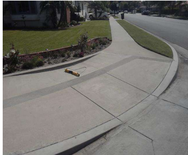
Curb Ramp , Landings and Transitions : Top Landing Clear Length - Landings

Code Reference ADA 406, 406.4,CA 11B-406.5.3