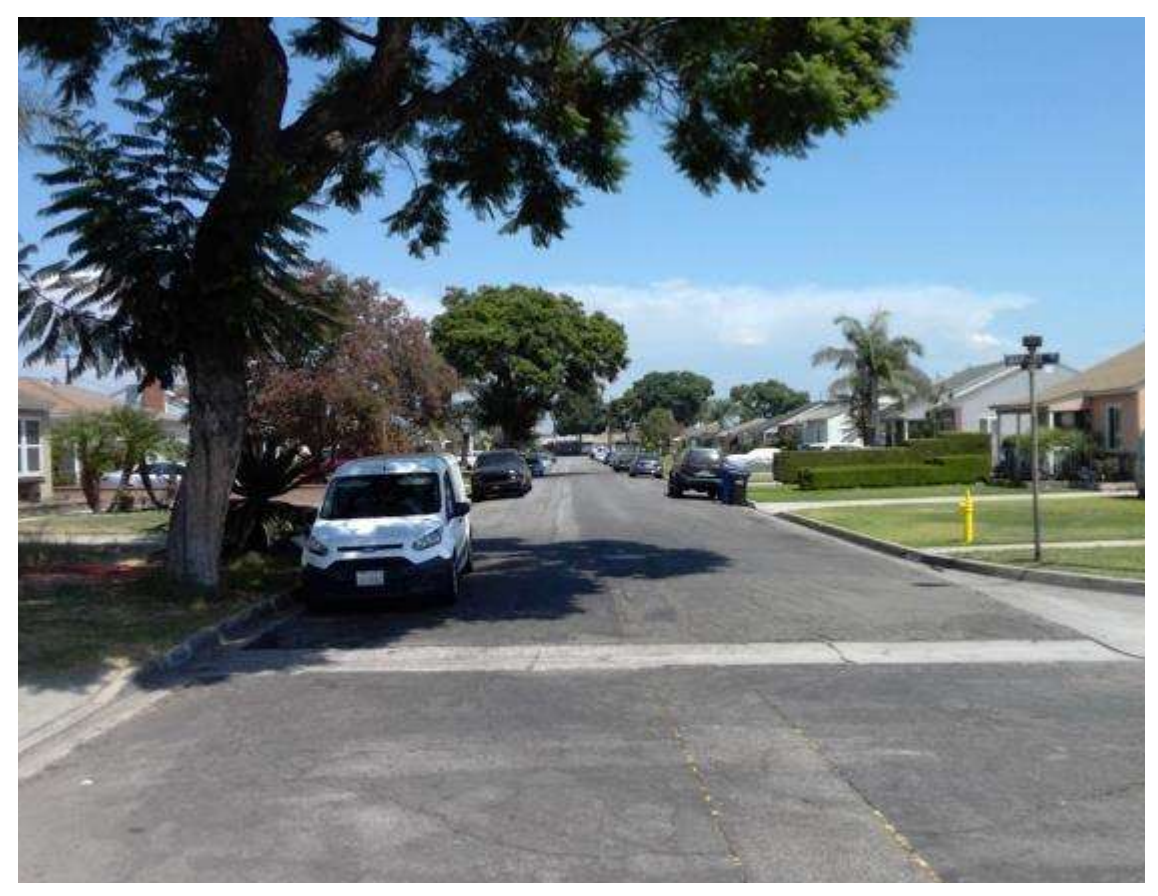
Mcgovern Avenue - Mantee Street to Arnett Street