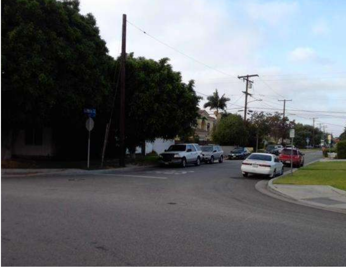
Myrtle Street - 5th Street to 2nd Street

5th Street to 2nd Street Downey, CA 90242