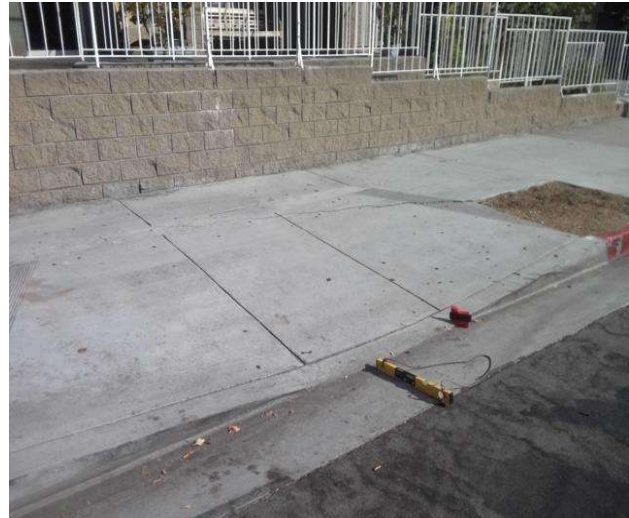
Curb Ramp , Landings And Transitions : Bottom Landing Change in Level

Code Reference ADA 302, 303, 406.2, 303.1