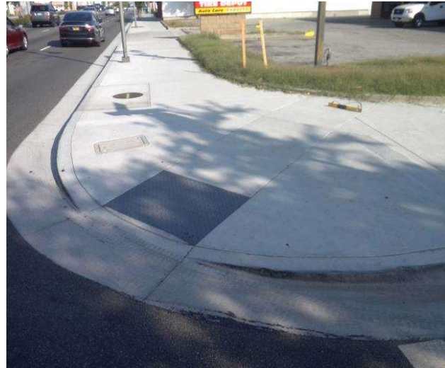
Curb Ramp , Landings and Transitions : Top Landing Slope

Code Reference ADA 402, 406.4, 403.3, 406.1, CA 11B-406.5.3