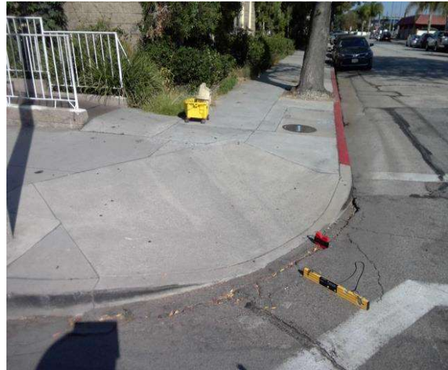
Curb Ramp , Landings And Transitions : Bottom Landing Change in Level

Code Reference ADA 302, 303, 406.2, 303.1