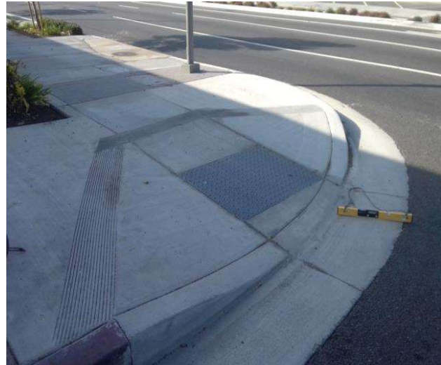
Curb Ramp : Bottom Landing Slope

Code Reference ADA 406, 406.2, CA 11B-406.5.8