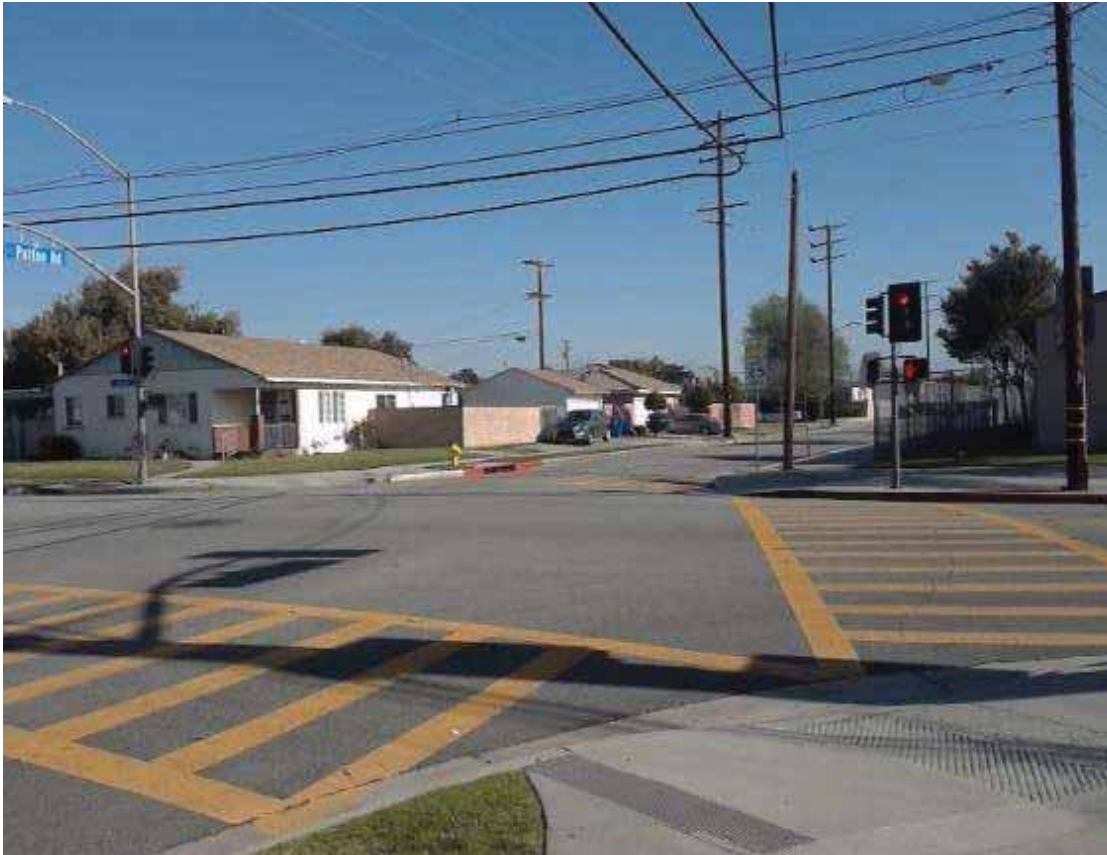
Patton Road - Alameda Street To Stewart & Gray Road

Alameda Street To Stewart & Gray Road Downey, CA 90242