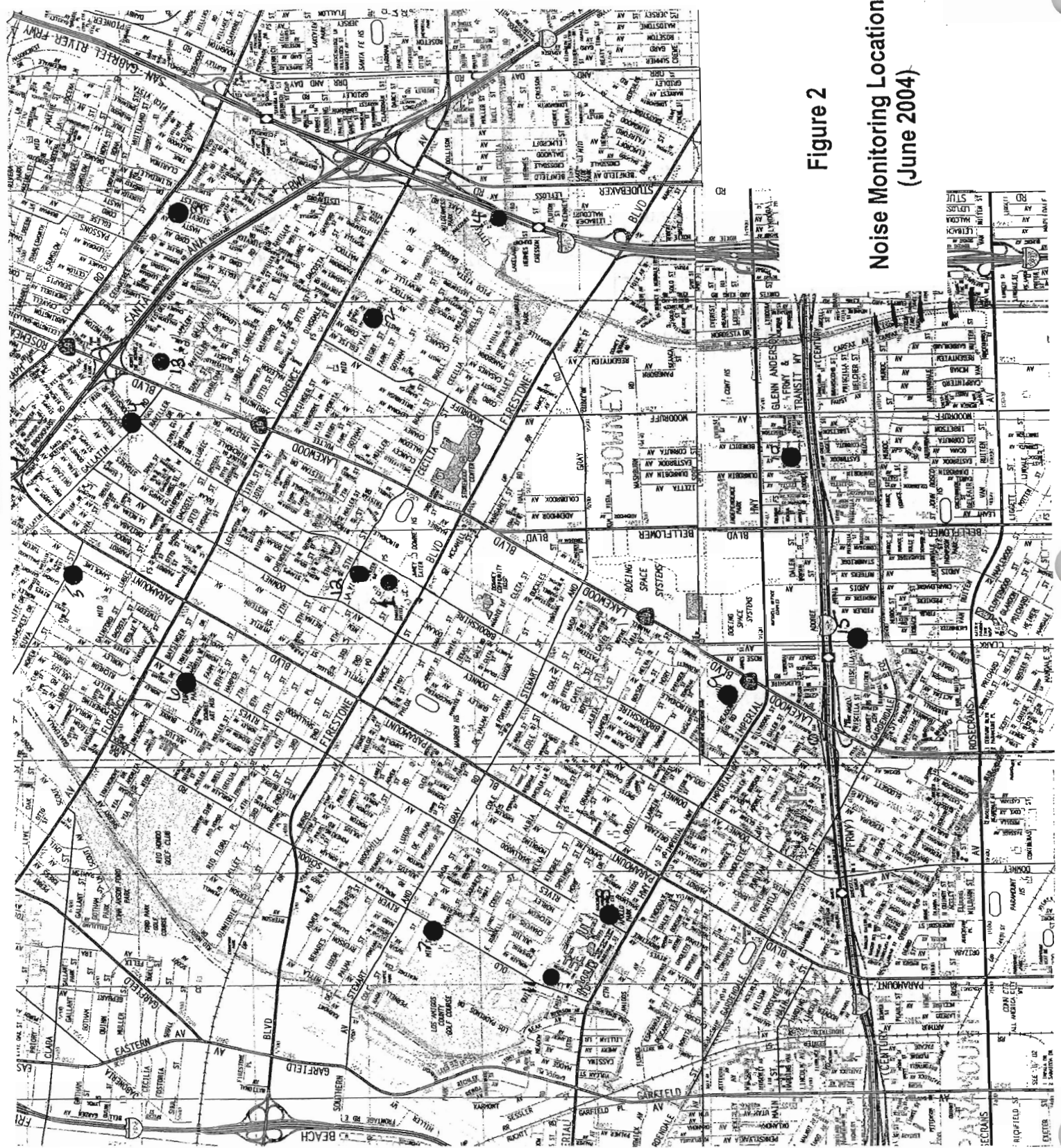
Figure 2 Noise Monitoring Locations (June 2004)