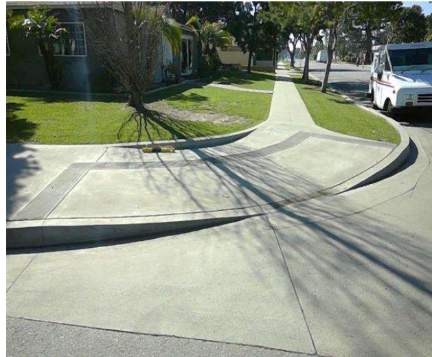
Curb Ramp , Landings and Transitions : Top Landing Slope

Code Reference ADA 402, 406.4, 403.3, 406.1, CA 11B-406.5.3