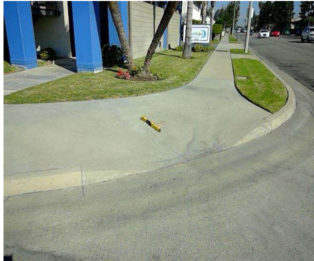
Curb Ramp , Landings and Transitions : Top Landing Clear Length - Landings

Code Reference ADA 406, 406.4,CA 11B-406.5.3