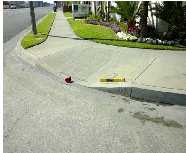
Curb Ramp , Landings and Transitions : Bottom Landing Change in Level - Curb Ramps