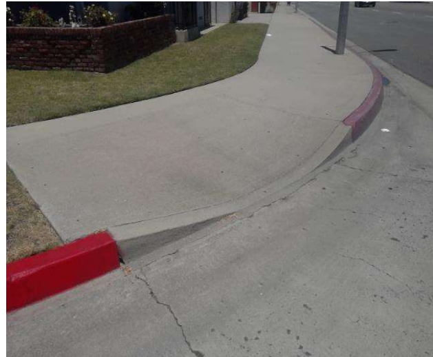
Curb Ramp , Landings and Transitions : Top Landing Clear Length - Landings

Code Reference ADA 406, 406.4,CA 11B-406.5.3