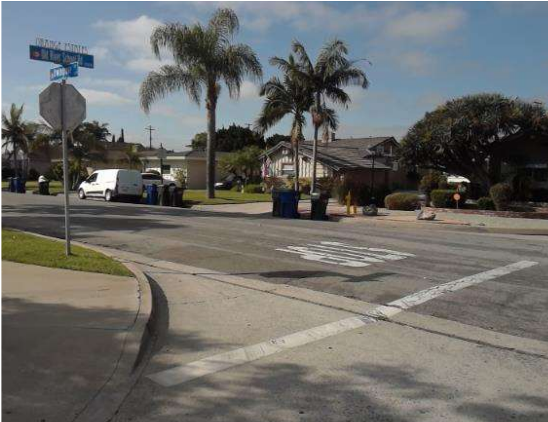
Irvinggrove Drive - Old River School Road to Rives Avenue

Old River School Road to Rives Avenue Downey, CA 90242