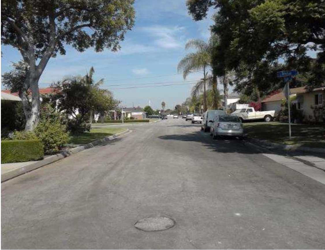
Lubec Street - Tristan Drive to End