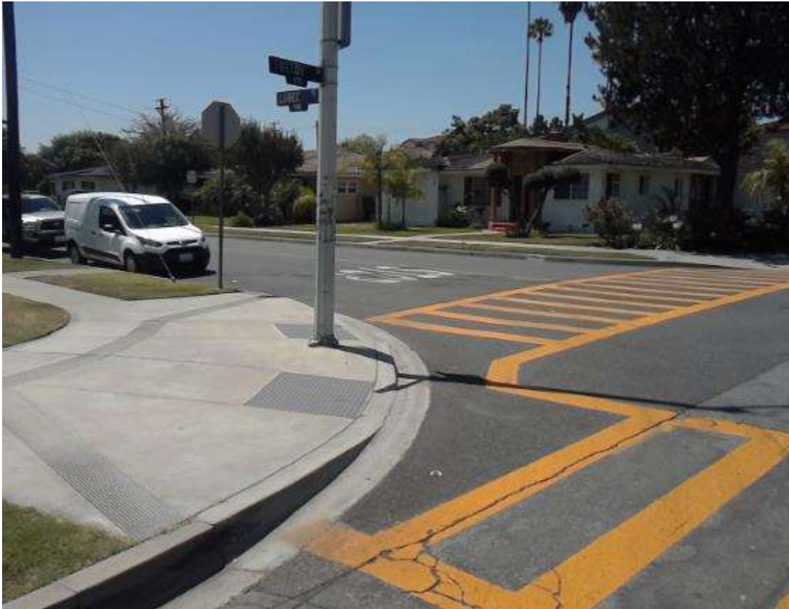
Lubec Street - Tweedy Lane to Paramount Boulevard