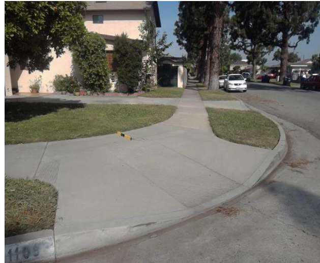
Curb Ramp , Landings and Transitions : Bottom Landing Change in Level - Curb Ramps