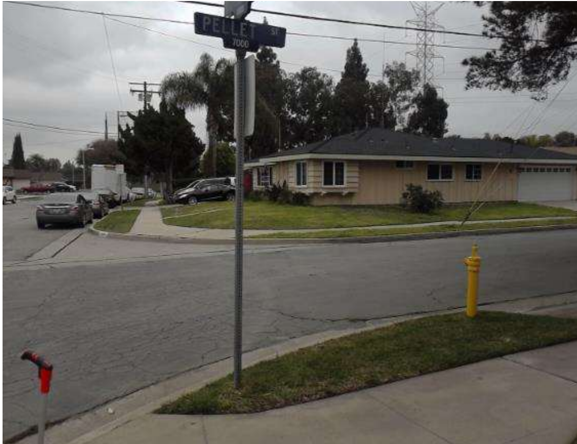
Pellet Street - Rio Hondo Drive To Old River School Road

Rio Hondo Drive To Old River School Road Downey, CA 90421