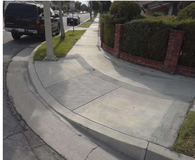
Curb Ramp , Landings and Transitions : Top Landing Clear Length - Landings

Code Reference ADA 406, 406.4,CA 11B-406.5.3