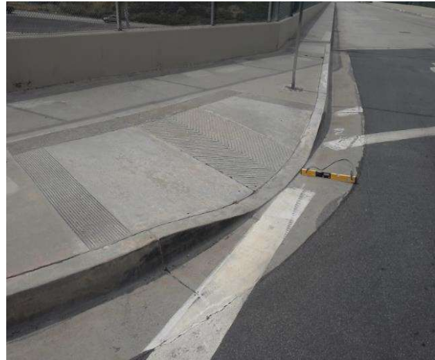
Curb Ramp , Landings And Transitions : Bottom Landing Change in Level

Code Reference ADA 302, 303, 406.2, 303.1