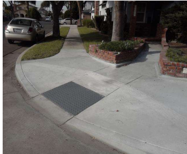
Curb Ramp , Landings and Transitions : Top Landing Clear Length - Landings

Code Reference ADA 406, 406.4,CA 11B-406.5.3