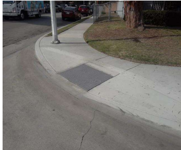
Curb Ramp , Landings and Transitions : Top Landing Clear Length - Landings

Code Reference ADA 406, 406.4,CA 11B-406.5.3