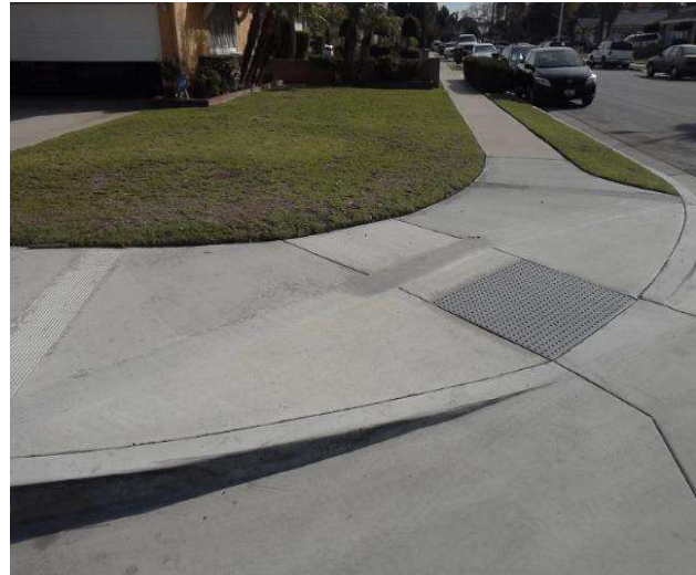
Curb Ramp , Landings and Transitions : Top Landing Clear Length - Landings

Code Reference ADA 406, 406.4,CA 11B-406.5.3