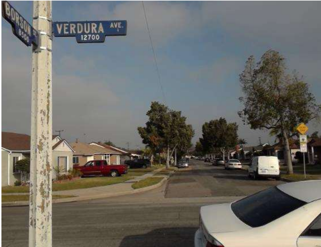
Borson Street - Verdura Avenue To Cul-de-sac