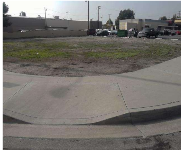
Curb Ramp , Landings and Transitions : Top Landing Slope

Code Reference ADA 402, 406.4, 403.3, 406.1, CA 11B-406.5.3