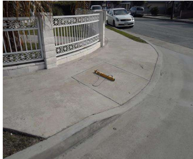
Curb Ramp , Landings and Transitions : Bottom Landing Change in Level - Curb Ramps