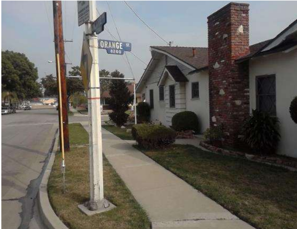
Orange Street - Caladre Avenue To Paramount Boulevard