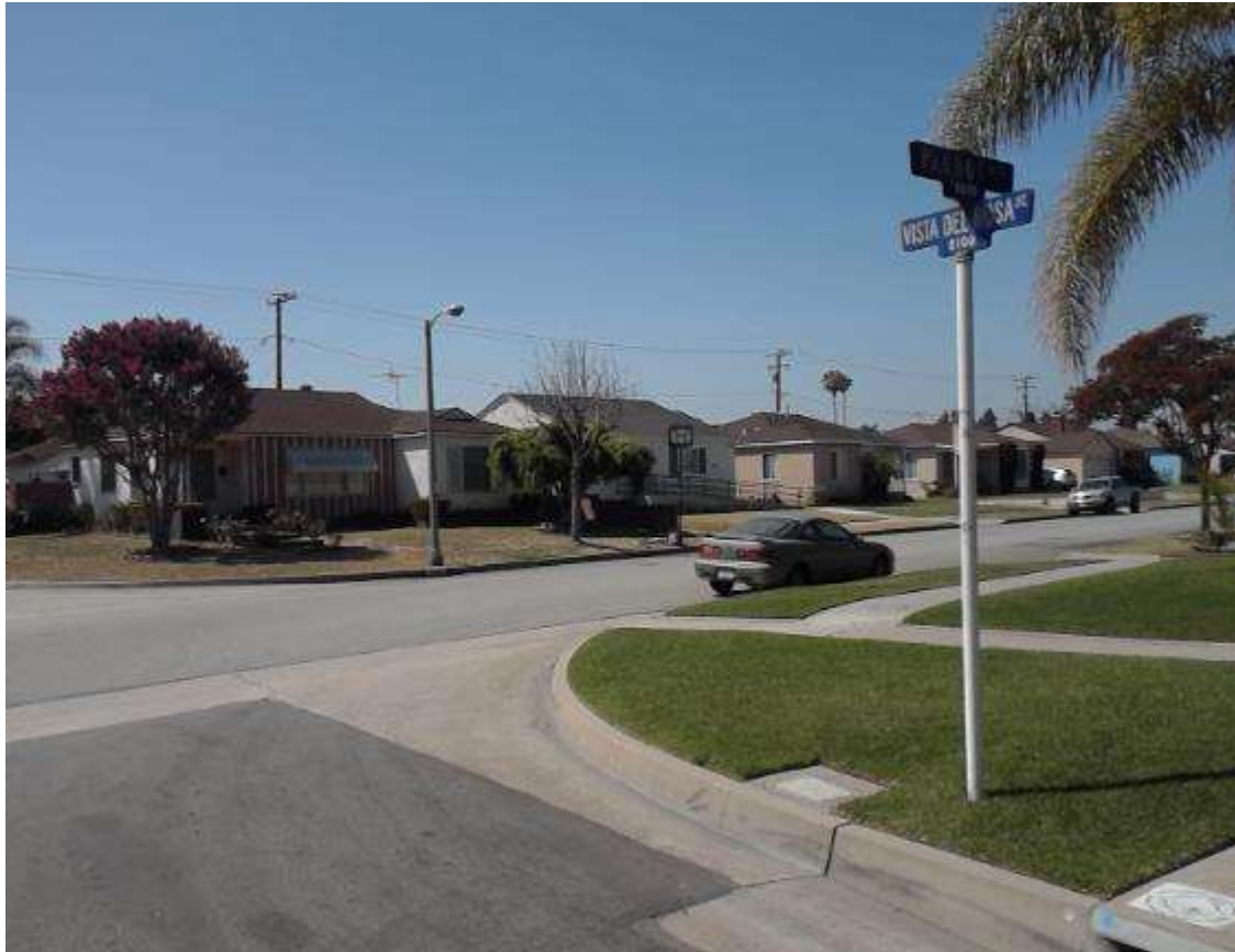
Parrot Avenue - Vista Del Rosa Street to Brookpark Road

Vista Del Rosa Street to Brookpark Road Downey, CA 90242