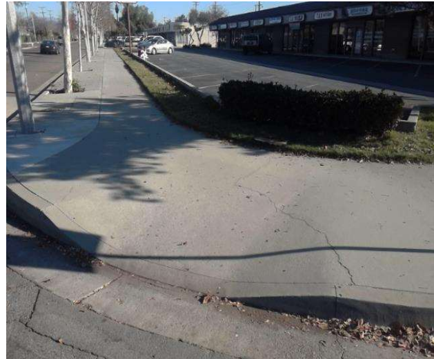
Curb Ramp , Landings and Transitions : Top Landing Clear Length - Landings

Code Reference ADA 406, 406.4,CA 11B-406.5.3