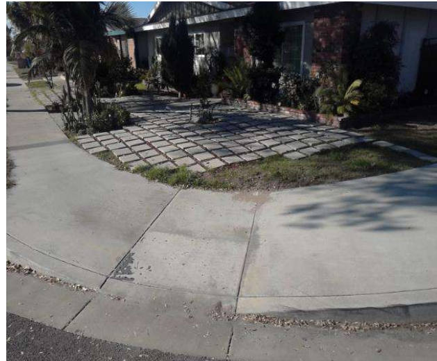
Curb Ramp , Landings and Transitions : Top Landing Right Side Slope - Parallel Curb Ramp

Code Reference ADA 406.4, 403.3, 406.1, CA 11B-406.5.3