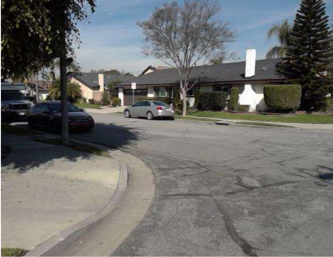
Melva Street - Lakewood Boulevard To Marbel Avenue

Lakewood Boulevard To Marbel Avenue Downey, CA 90242