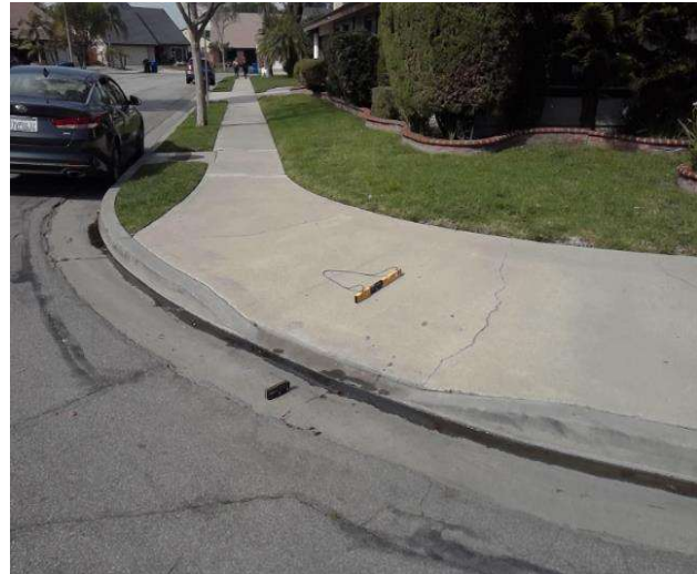
Curb Ramp , Landings and Transitions : Bottom Landing Change in Level - Curb Ramps