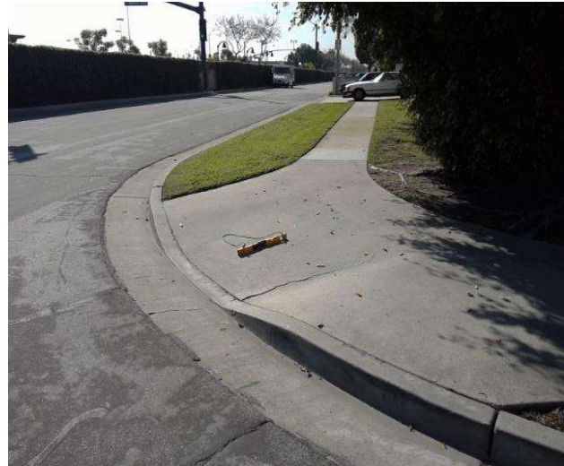
Curb Ramp : Bottom Landing Slope

Code Reference ADA 406, 406.2, CA 11B-406.5.8