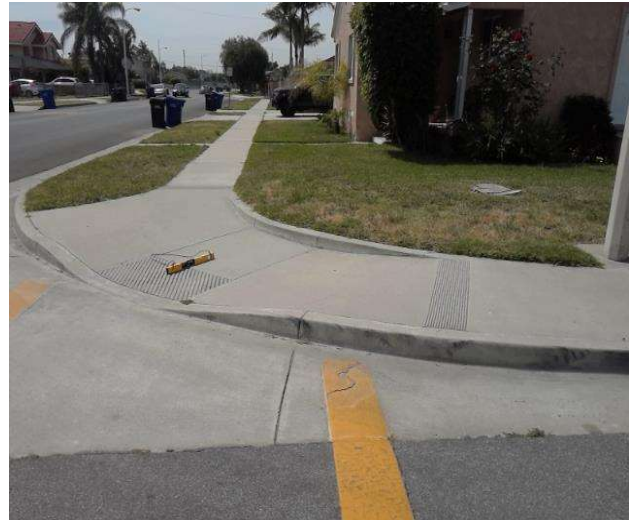
Curb Ramp , Landings and Transitions : Top Landing Right Side Slope - Parallel Curb Ramp

Code Reference ADA 406.4, 403.3, 406.1, CA 11B-406.5.3