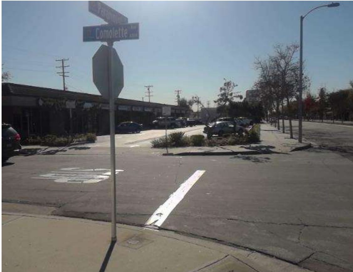
Comolette Street -Paramout Boulevard To Downey Avenue

Paramout Boulevard To Downey Avenue Downey, CA 90242