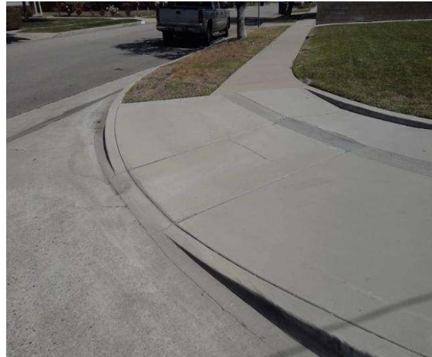
Curb Ramp , Landings and Transitions : Top Landing Clear Length - Landings

Code Reference ADA 406, 406.4,CA 11B-406.5.3