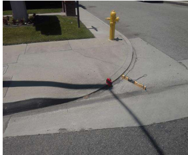
Curb Ramp , Landings And Transitions : Bottom Landing Change in Level

Code Reference ADA 302, 303, 406.2, 303.1