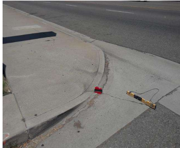
Curb Ramp , Landings And Transitions : Bottom Landing Change in Level

Code Reference ADA 302, 303, 406.2, 303.1