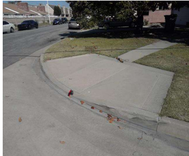
Curb Ramp , Landings and Transitions : Bottom Landing Change in Level - Curb Ramps