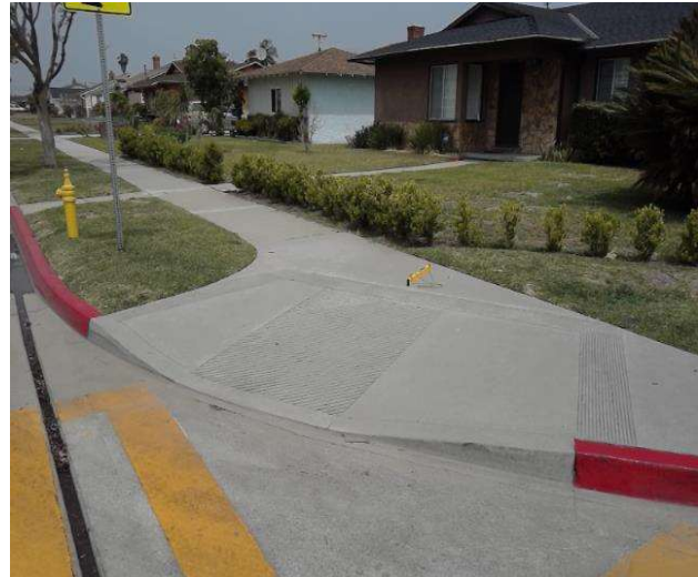
Curb Ramp , Landings and Transitions : Bottom Landing Change in Level - Curb Ramps