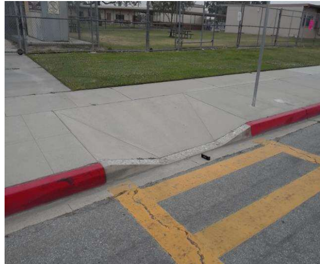
Curb Ramp , Landings and Transitions : Bottom Landing Change in Level - Curb Ramps