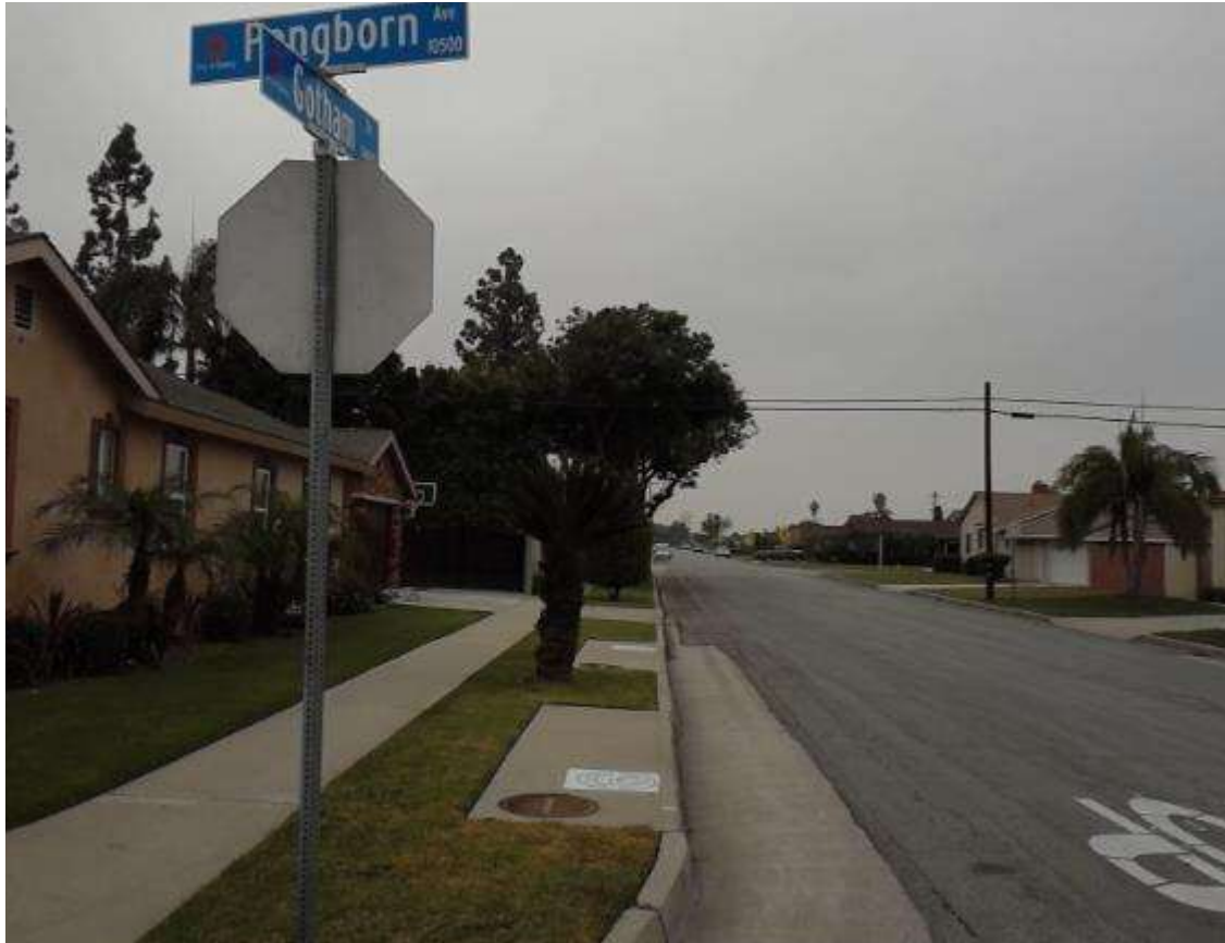
Gotham Street - Pangborn Avenue To Woodruff Avenue

Pangborn Avenue To Woodruff Avenue Downey, CA 90241