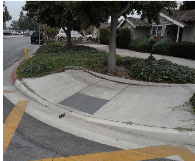
Curb Ramp , Landings and Transitions : Top Landing Clear Length - Landings

Code Reference ADA 406, 406.4,CA 11B-406.5.3