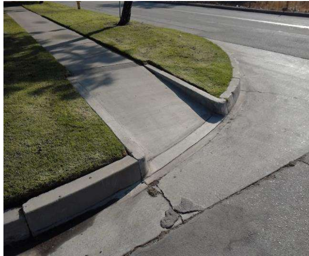
Curb Ramp , Landings and Transitions : Bottom Landing Change in Level - Curb Ramps