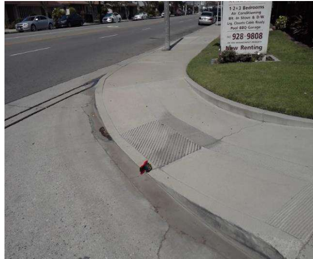
Curb Ramp , Landings And Transitions : Bottom Landing Change in Level

Code Reference ADA 302, 303, 406.2, 303.1