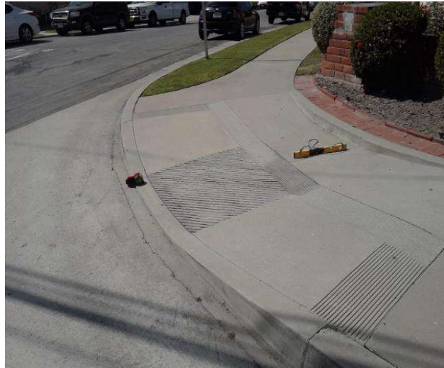
Curb Ramp , Landings And Transitions : Bottom Landing Change in Level

Code Reference ADA 302, 303, 406.2, 303.1