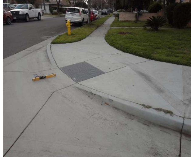
Curb Ramp , Landings and Transitions : Top Landing Clear Length - Landings

Code Reference ADA 406, 406.4,CA 11B-406.5.3