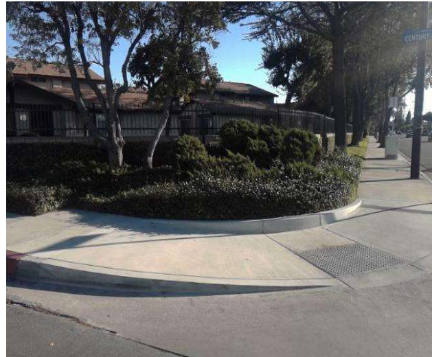
Curb Ramp , Landings and Transitions : Top Landing Right Side Slope - Parallel Curb Ramp

Code Reference ADA 406.4, 403.3, 406.1, CA 11B-406.5.3