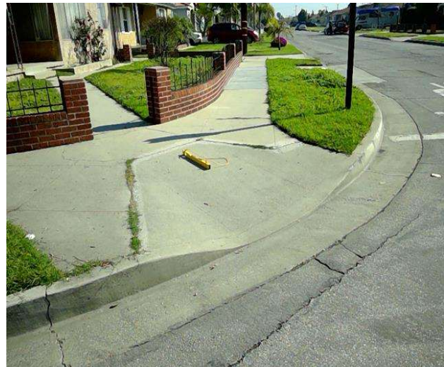
Curb Ramp , Landings and Transitions : Bottom Landing Change in Level - Curb Ramps