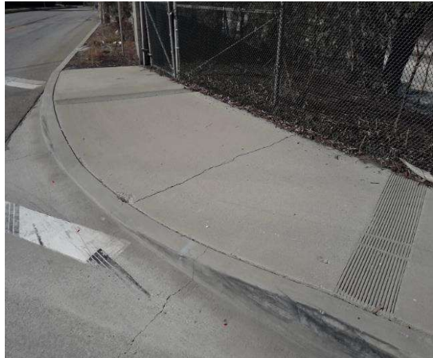
Curb Ramp , Landings and Transitions : Bottom Landing Change in Level - Curb Ramps