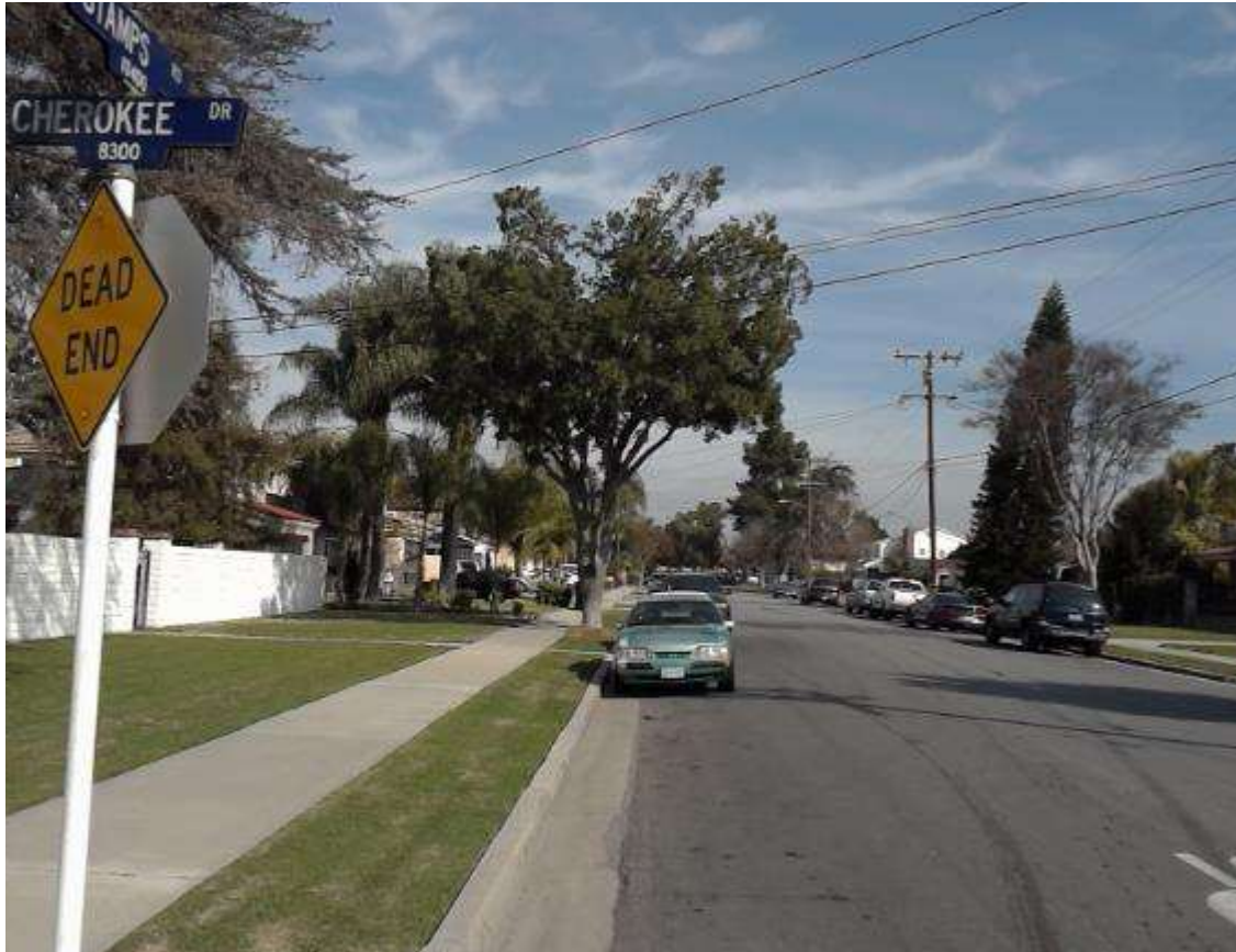
Stamps Road - Cherokee Drive To End