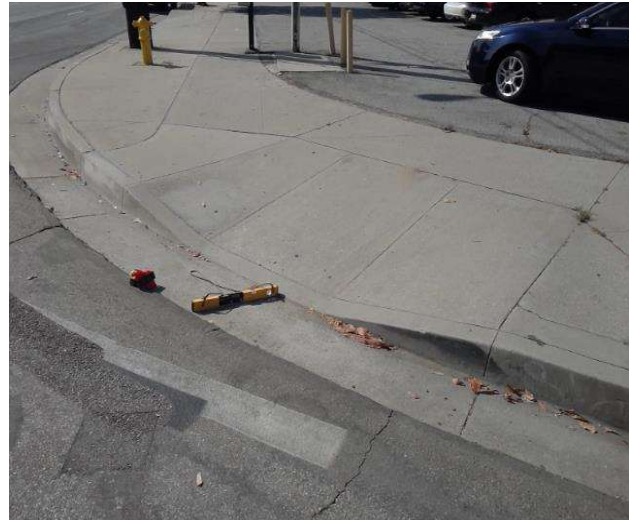
Curb Ramp , Landings And Transitions : Bottom Landing Change in Level

Code Reference ADA 302, 303, 406.2, 303.1