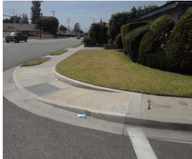
Curb Ramp , Landings and Transitions : Top Landing Right Side Slope - Parallel Curb Ramp

Code Reference ADA 406.4, 403.3, 406.1, CA 11B-406.5.3