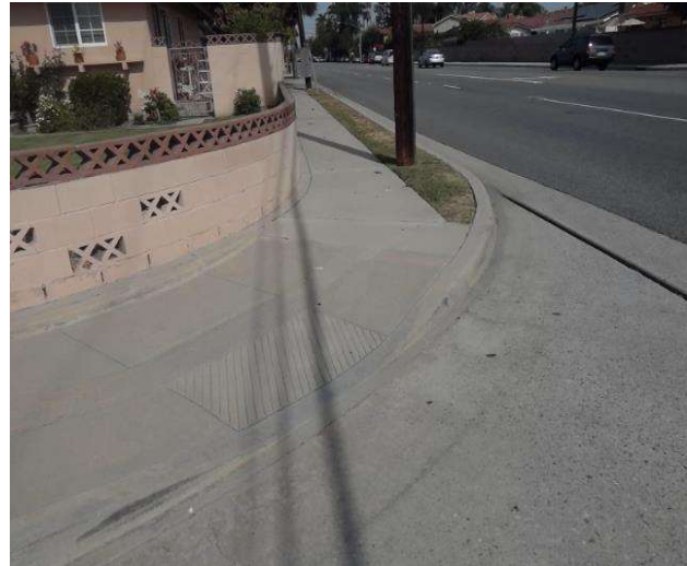
Curb Ramp , Landings And Transitions : Bottom Landing Change in Level

Code Reference ADA 302, 303, 406.2, 303.1