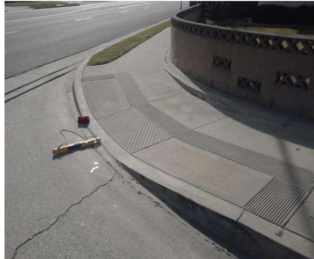
Curb Ramp , Landings and Transitions : Bottom Landing Change in Level - Curb Ramps