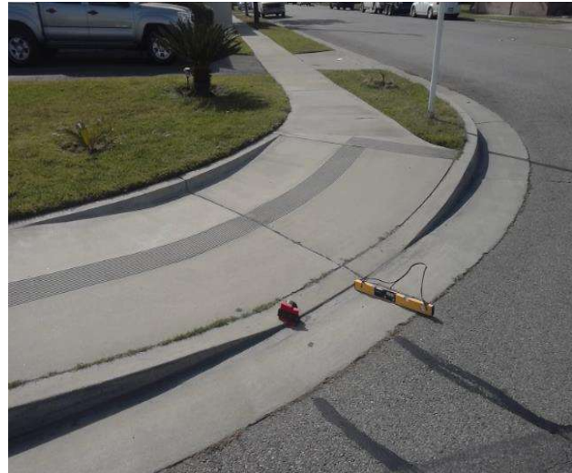
Curb Ramp , Landings and Transitions : Bottom Landing Change in Level - Curb Ramps