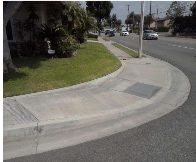
Curb Ramp , Landings and Transitions : Top Landing Right Side Slope - Parallel Curb Ramp

Code Reference ADA 406.4, 403.3, 406.1, CA 11B-406.5.3