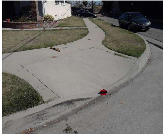
Curb Ramp , Landings and Transitions : Bottom Landing Change in Level - Curb Ramps