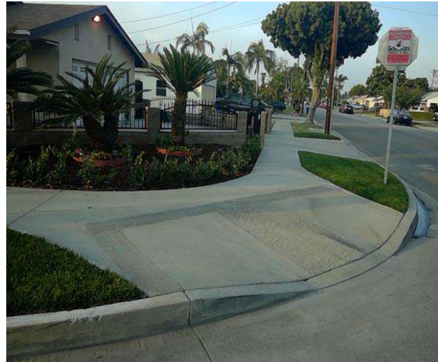
Curb Ramp , Landings and Transitions : Bottom Landing Change in Level - Curb Ramps