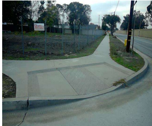
Curb Ramp , Landings And Transitions : Bottom Landing Change in Level

Code Reference ADA 302, 303, 406.2, 303.1