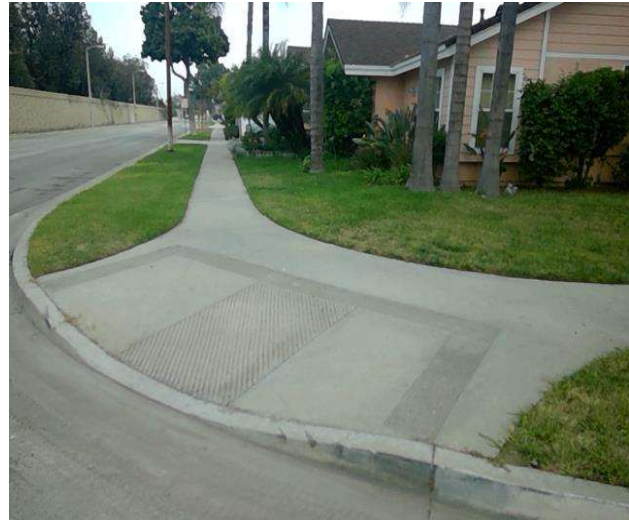
Curb Ramp , Landings And Transitions : Bottom Landing Change in Level

Code Reference ADA 302, 303, 406.2, 303.1