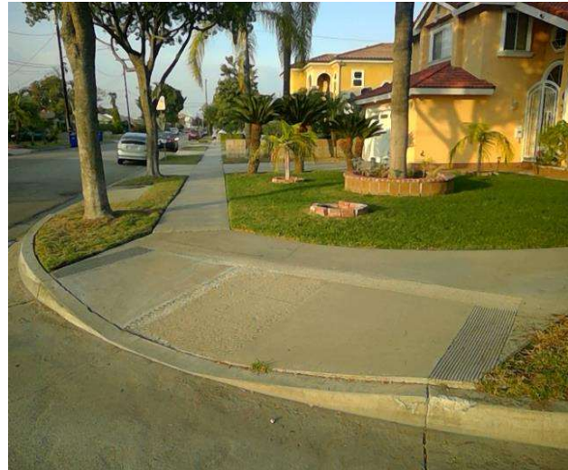
Curb Ramp , Landings And Transitions : Bottom Landing Change in Level

Code Reference ADA 302, 303, 406.2, 303.1