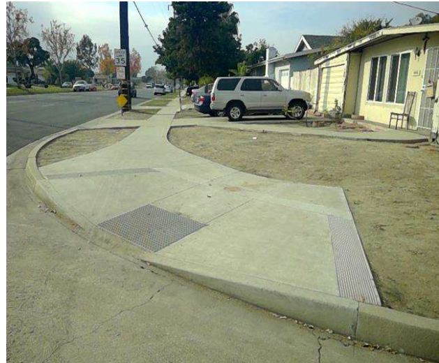
Curb Ramp , Landings and Transitions : Top Landing Clear Length - Landings

Code Reference ADA 406, 406.4,CA 11B-406.5.3