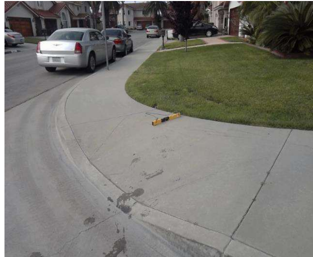
Curb Ramp , Landings and Transitions : Bottom Landing Change in Level - Curb Ramps