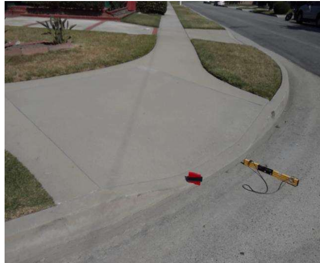
Curb Ramp , Landings And Transitions : Bottom Landing Change in Level

Code Reference ADA 302, 303, 406.2, 303.1