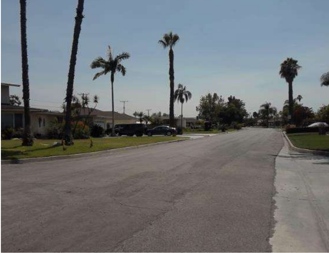
Bellman Avenue - Baysinger Street to Cherokee Drive

Baysinger Street to Cherokee Drive Downey, CA 90242