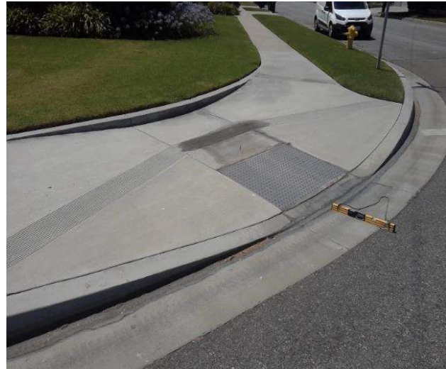
Curb Ramp , Landings and Transitions : Top Landing Clear Length - Landings

Code Reference ADA 406, 406.4,CA 11B-406.5.3