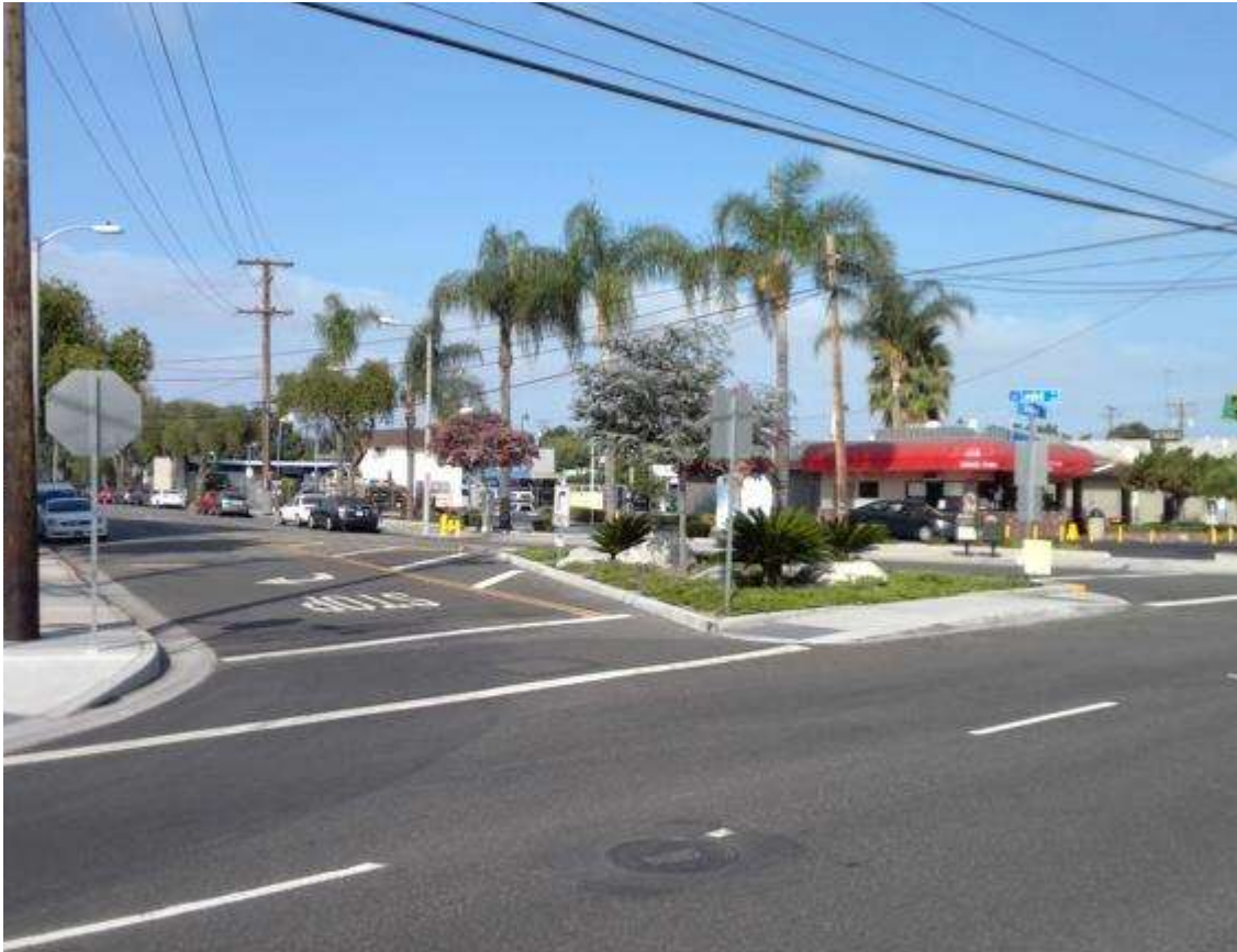
Lindell Avenue - Telegraph Road to I-5 Off Ramp

Telegraph Road to I-5 Off Ramp Downey, CA 90242