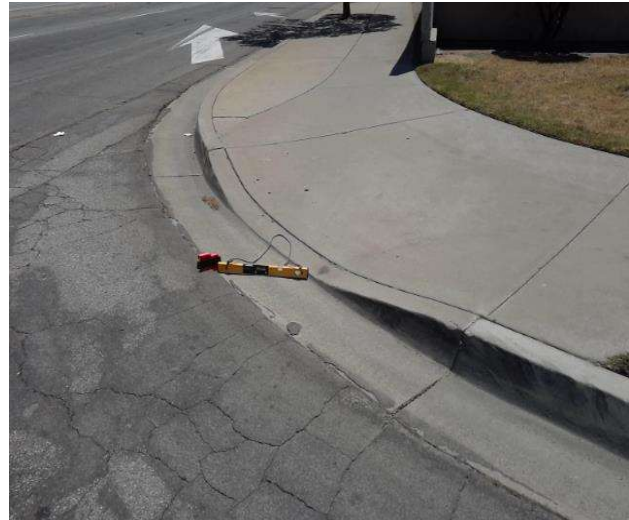
Curb Ramp , Landings And Transitions : Bottom Landing Change in Level

Code Reference ADA 302, 303, 406.2, 303.1