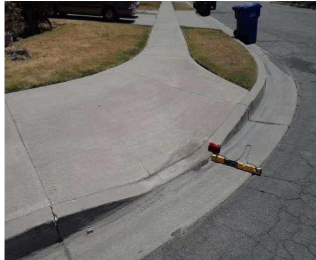
Curb Ramp , Landings And Transitions : Bottom Landing Change in Level

Code Reference ADA 302, 303, 406.2, 303.1