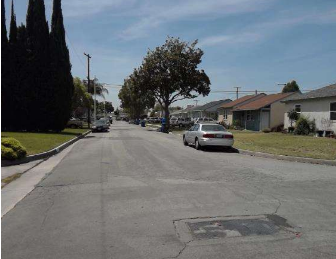
Pruess Avenue - Cleta Street To De Palma Street

Cleta Street To De Palma Street Downey, CA 90242