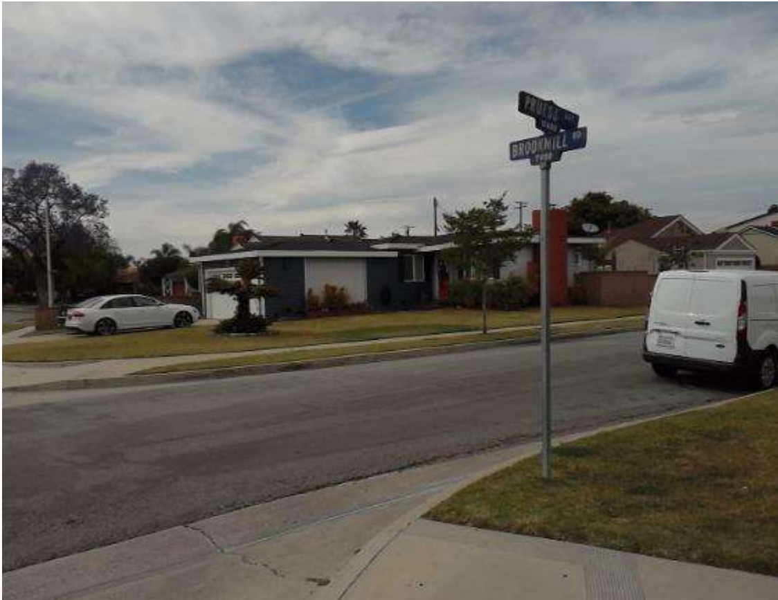
Pruess Avenue - Brookmill Road To Phlox Street

Brookmill Road To Phlox Street Downey, CA 90242