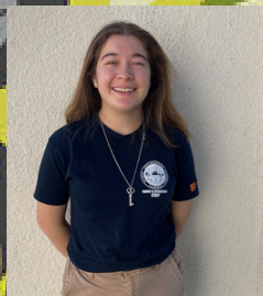
Ms. Frankee Animal: Rabbit