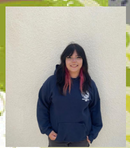
Ms. Athena Animal: Cat