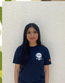
Ms. Leia Animal: Dog