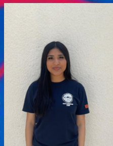
Ms. Leia Color: rainbow