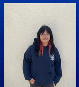
Ms. Athena Color: pink