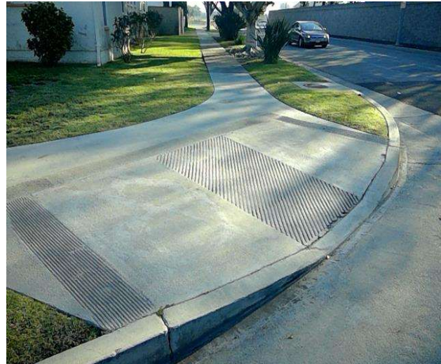
Curb Ramp , Landings and Transitions : Bottom Landing Change in Level - Curb Ramps