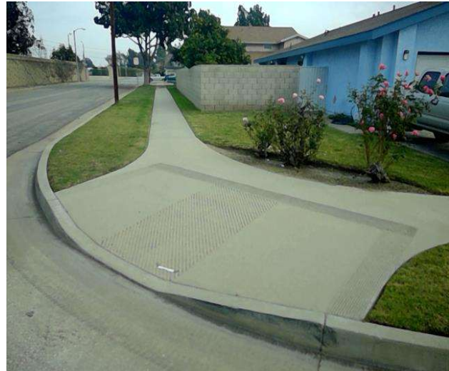
Curb Ramp , Landings And Transitions : Bottom Landing Change in Level

Code Reference ADA 302, 303, 406.2, 303.1