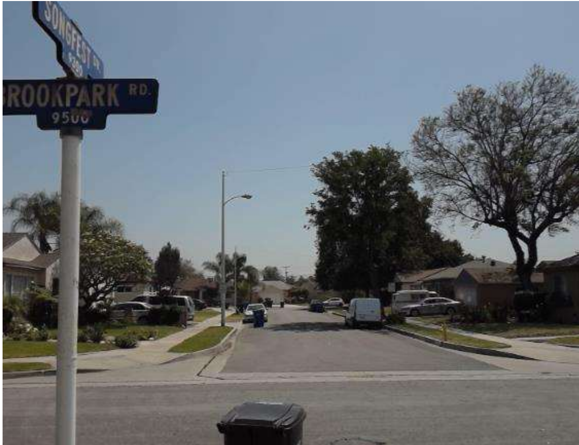
Songfest Drive - Brookpark Road to Klinedale Avenue

Brookpark Road to Klinedale Avenue Downey, CA 90242