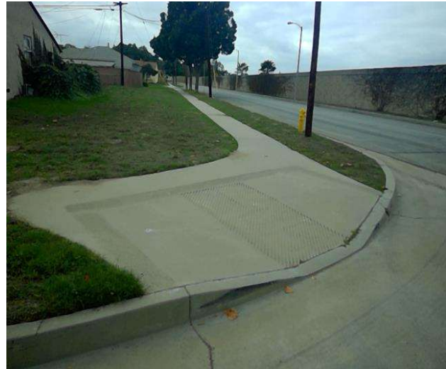
Curb Ramp , Landings And Transitions : Bottom Landing Change in Level

Code Reference ADA 302, 303, 406.2, 303.1