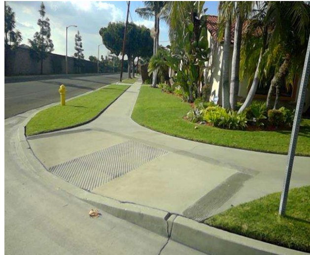
Curb Ramp , Landings And Transitions : Bottom Landing Change in Level

Code Reference ADA 302, 303, 406.2, 303.1