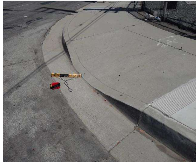
Curb Ramp , Landings And Transitions : Bottom Landing Change in Level

Code Reference ADA 302, 303, 406.2, 303.1