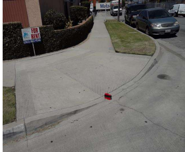
Curb Ramp , Landings and Transitions : Top Landing Clear Length - Landings

Code Reference ADA 406, 406.4, CA 11B-406.5.3