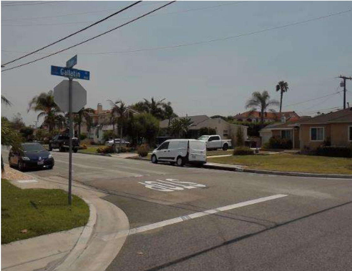
Stoakes Avenue - Gallatin Road to Vista Del Rio Avenue

Gallatin Road to Vista Del Rio Avenue Downey, CA 90242