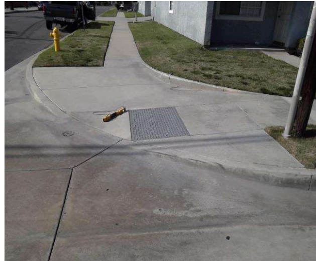
Curb Ramp , Landings and Transitions : Top Landing Right Side Slope - Parallel Curb Ramp

Code Reference ADA 406.4, 403.3, 406.1, CA 11B-406.5.3