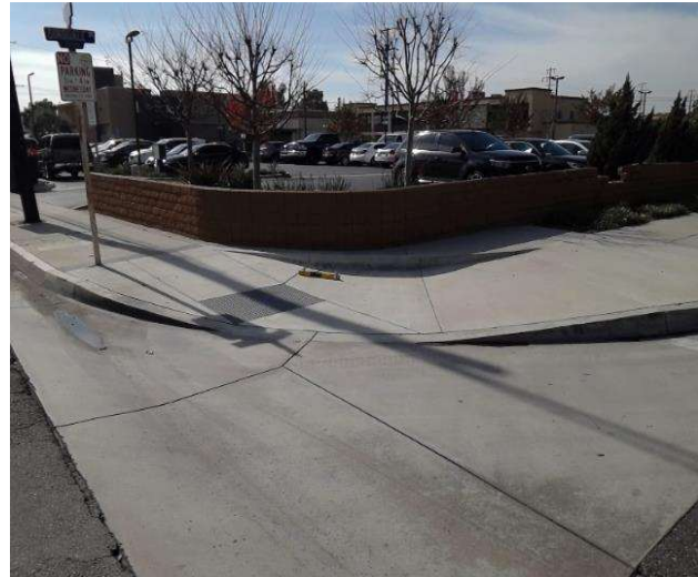
Curb Ramp , Landings and Transitions : Top Landing Right Side Slope - Parallel Curb Ramp

Code Reference ADA 406.4, 403.3, 406.1, CA 11B-406.5.3