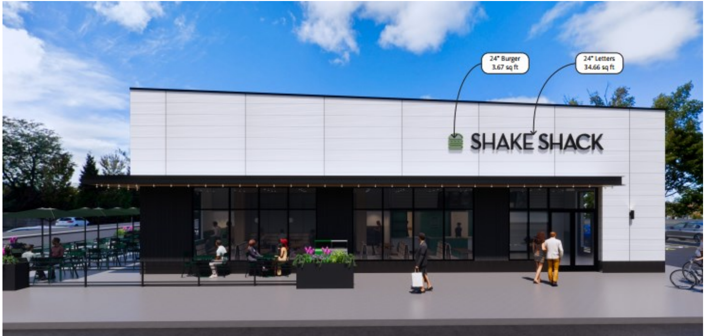
Shake Shack (8300 Firestone Blvd) applied for Building Permits in 2023.