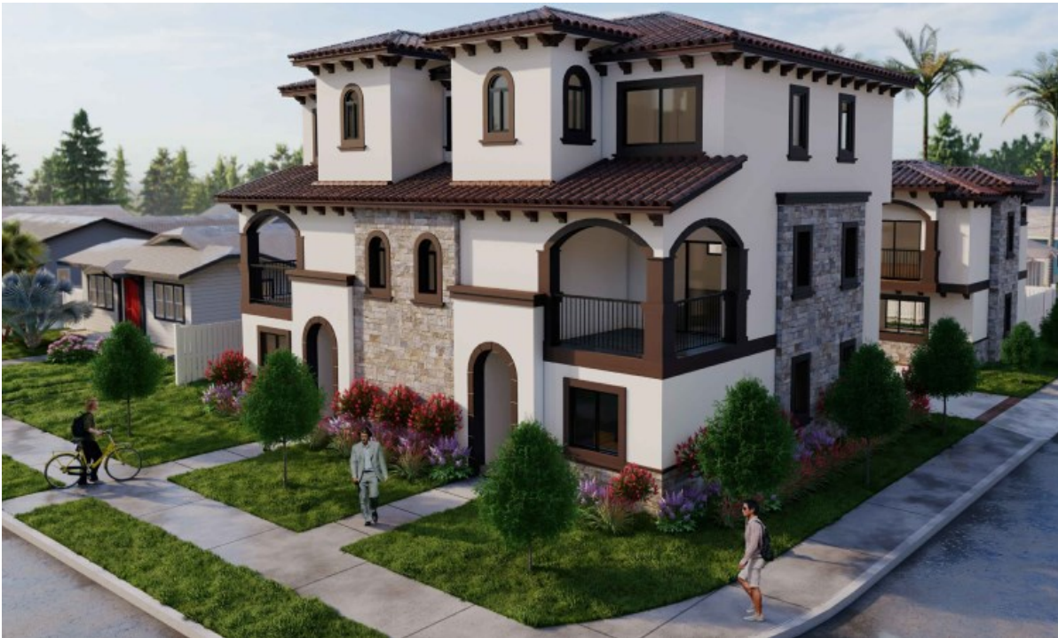
Multifamily Development (10736 La Reina Ave) was approved by the Planning Commission in 2023.