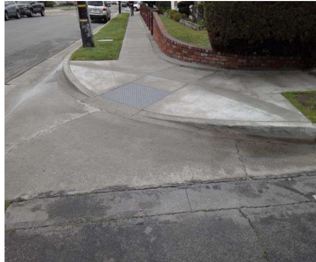
Curb Ramp , Landings and Transitions : Top Landing Clear Length - Landings

Code Reference ADA 406, 406.4,CA 11B-406.5.3