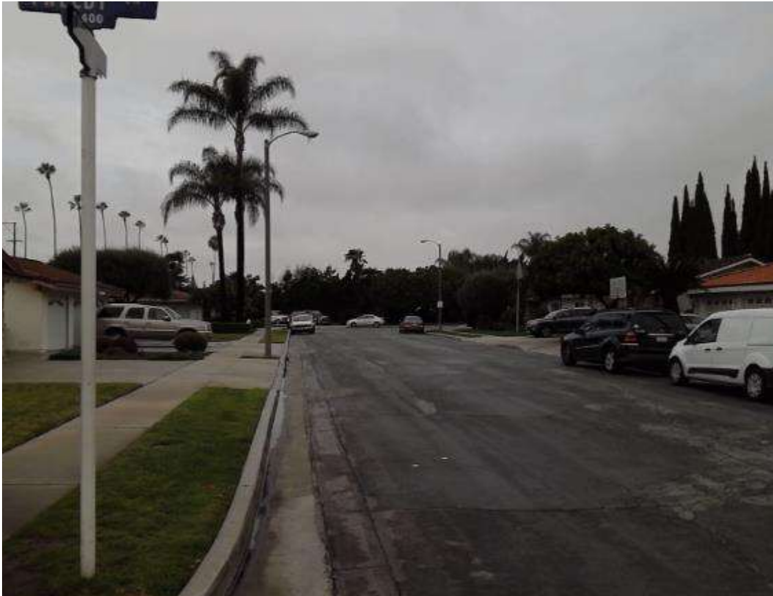
Calmcrest Drive - Tweedy Lane to Cul-de-sac

Tweedy Lane to Cul-de-sac Downey, CA 90240