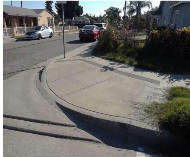
Curb Ramp , Landings and Transitions : Top Landing Clear Length - Landings

Code Reference ADA 406, 406.4,CA 11B-406.5.3