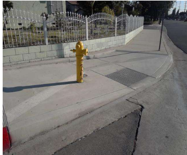
Curb Ramp , Landings and Transitions : Top Landing Clear Length - Landings

Code Reference ADA 406, 406.4,CA 11B-406.5.3