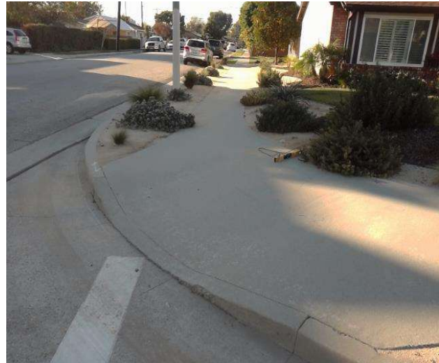
Curb Ramp , Landings And Transitions : Bottom Landing Change in Level

Code Reference ADA 302, 303, 406.2, 303.1