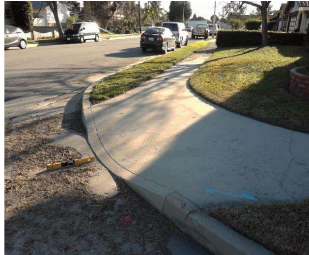
Curb Ramp , Landings and Transitions : Top Landing Clear Length - Landings

Code Reference ADA 406, 406.4,CA 11B-406.5.3