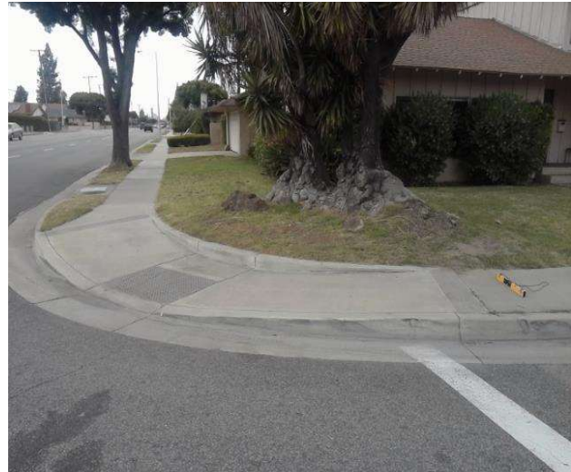
Curb Ramp , Landings and Transitions : Top Landing Right Side Slope - Parallel Curb Ramp

Code Reference ADA 406.4, 403.3, 406.1, CA 11B-406.5.3